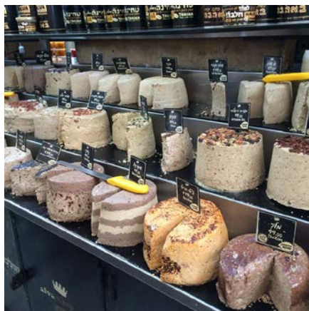
July 8, 2016