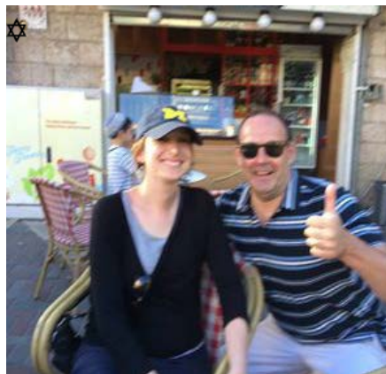
July 7, 2016

The feelings of holiness at this site in Jerusalem are simply overwhelming. Let us all take a moment today to pray for peace.